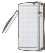
Stampin' Trimmer [126889] $30.00