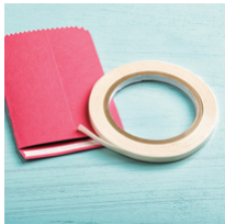
Tear & Tape Adhesive [138995 ] $7.00