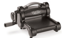
Big Shot [143263 ] $110.00