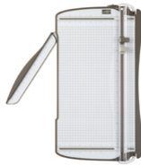
Stampin' Trimmer [126889 ] $30.00